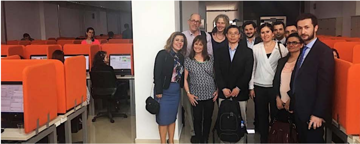
Turkish Quitline call center and staff