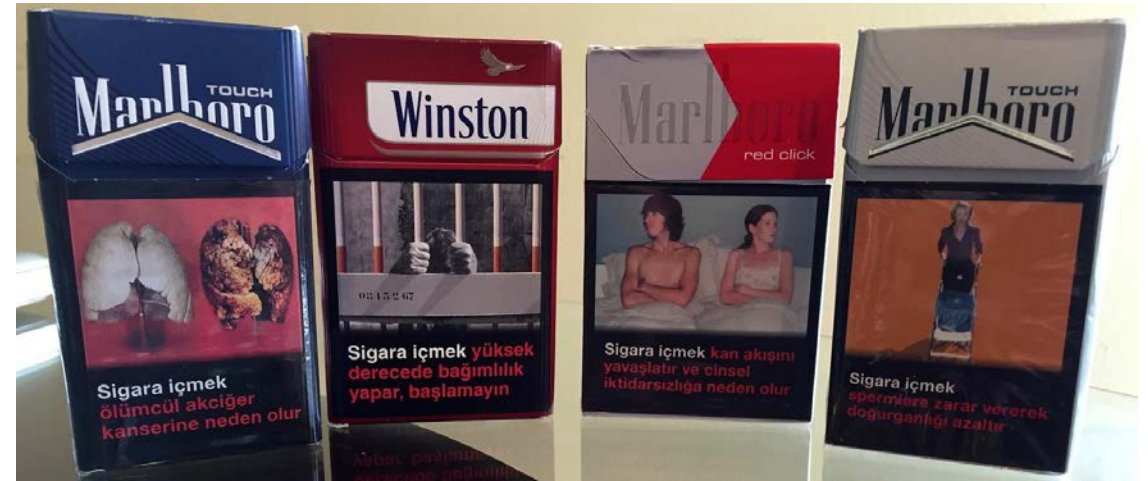
Turkish cigarette pack warnings